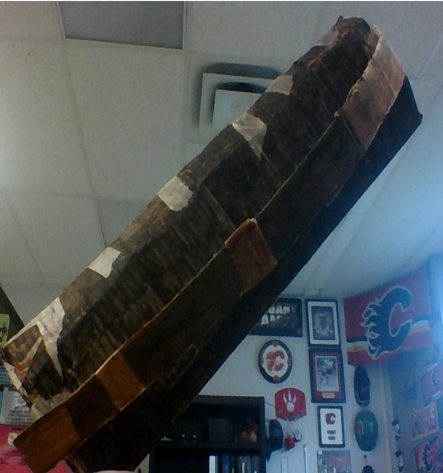
OUR GROUPS ARTIFACTS